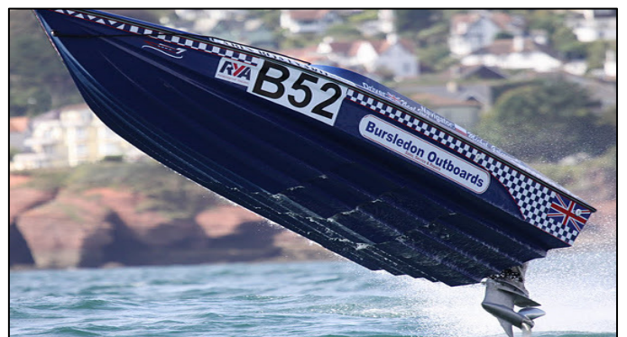
Neal Ives - Winner 2011