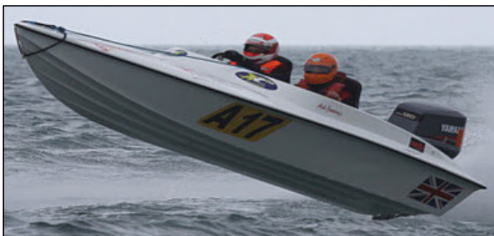
Contender No 1