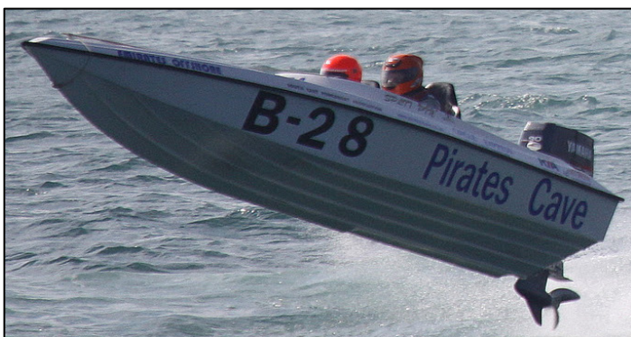
Contender No 3