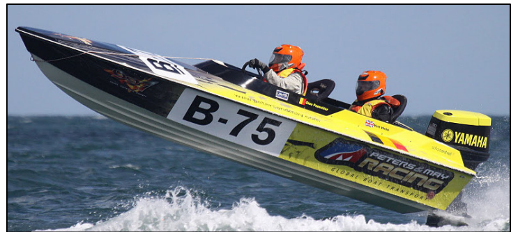
Contender No 2